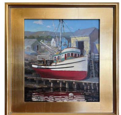
Fishing Boat, oil by Ned Lacy Best in Show 2023 CAL Pruy House Exhibit